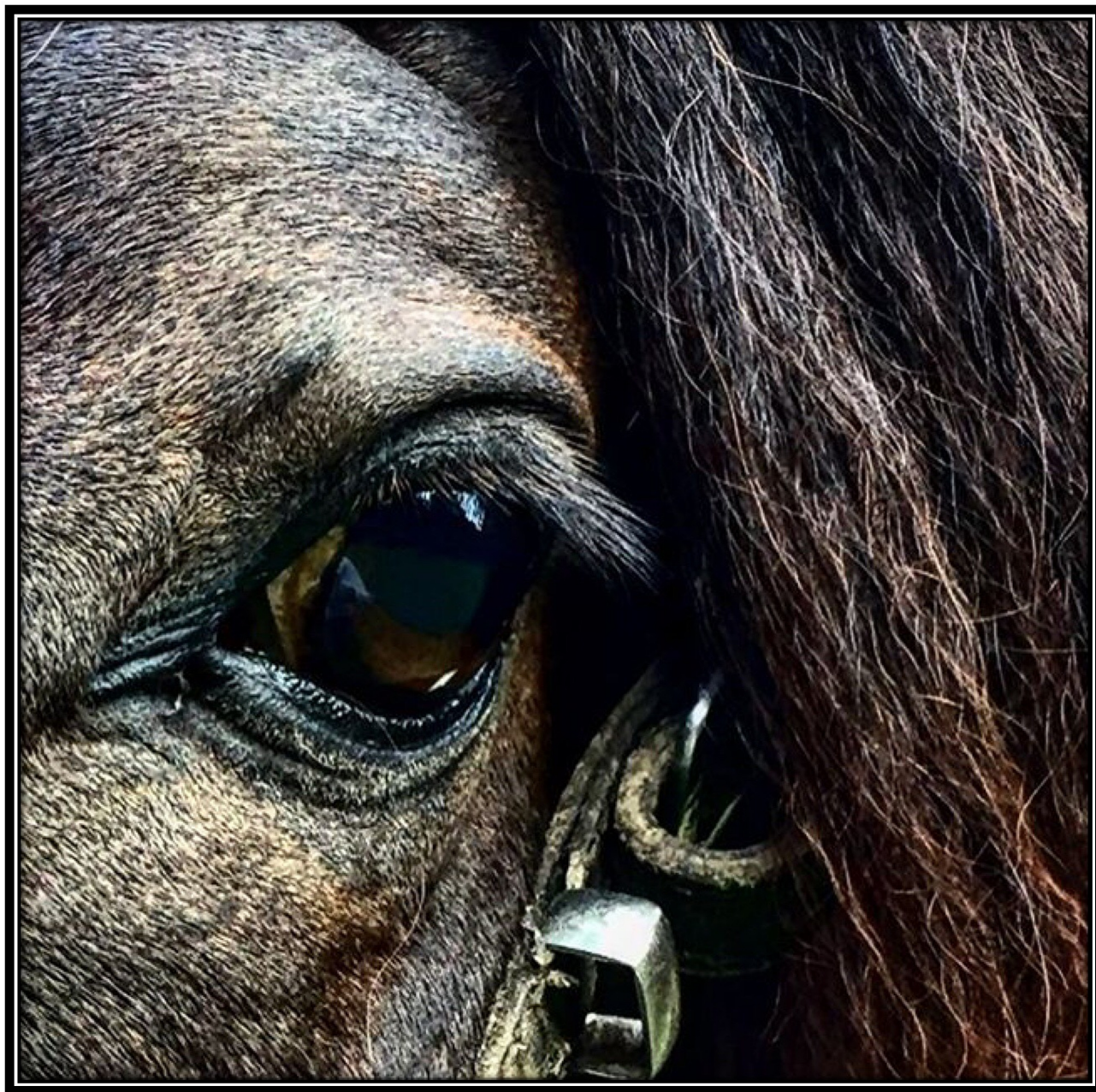
Armstrong Agriplex Armstrong, British Columbia